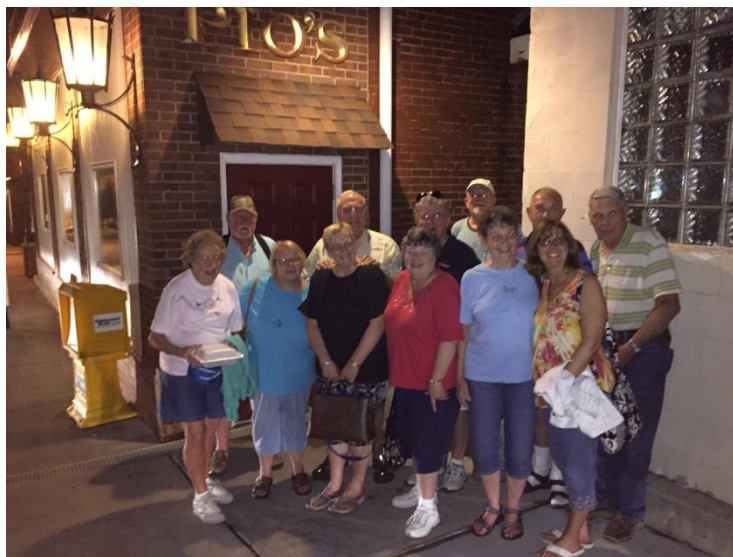
Dinner St. Charles