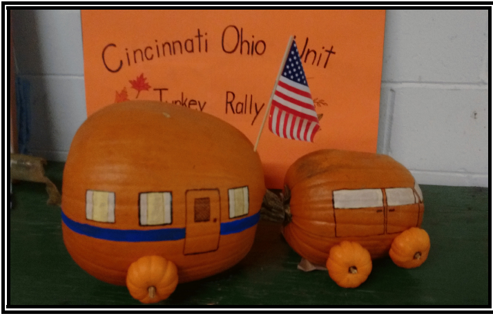
by Bev Drake