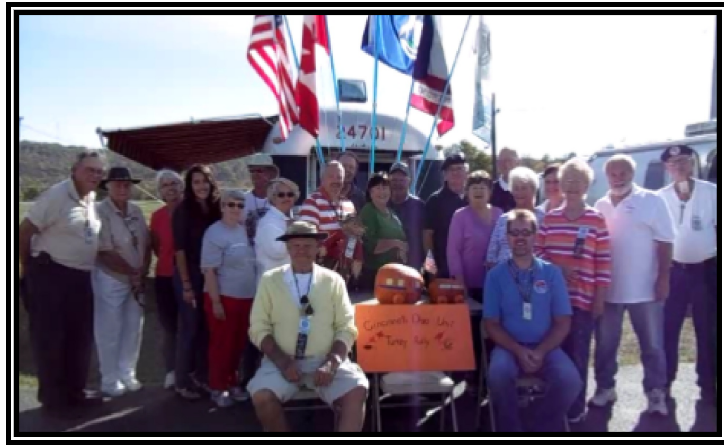
2015 Turkey Rally